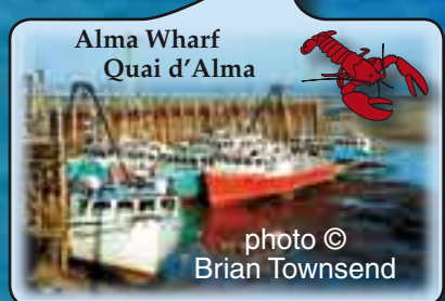
Alma Wharf Quai d'Alma