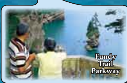
Fundy Trail Parkway